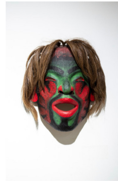
Beau Dick, Yo'lakwame , 1998, red cedar, acrylic, horsehair, 13 x 10.5 x 3 inches/33 x 26.7 x 7.6 cm Inquire