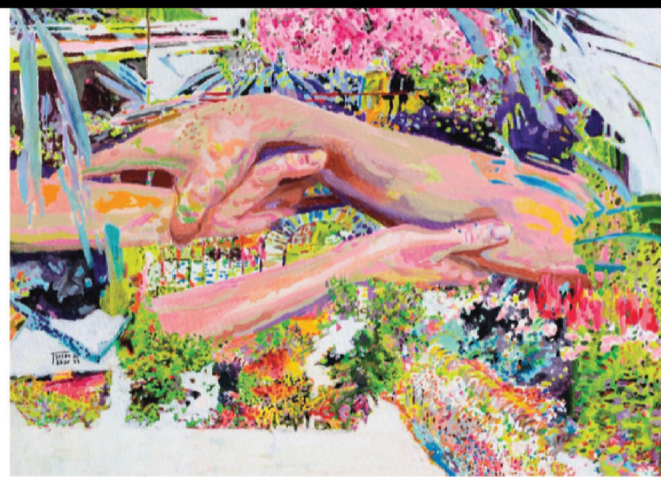
LIKE THE FIELDS HOLDING ON TO THEIR CROPS. 2023. ACRYLIC ON CANVAS. 94 X 98 CM, 37 X 39 IN.