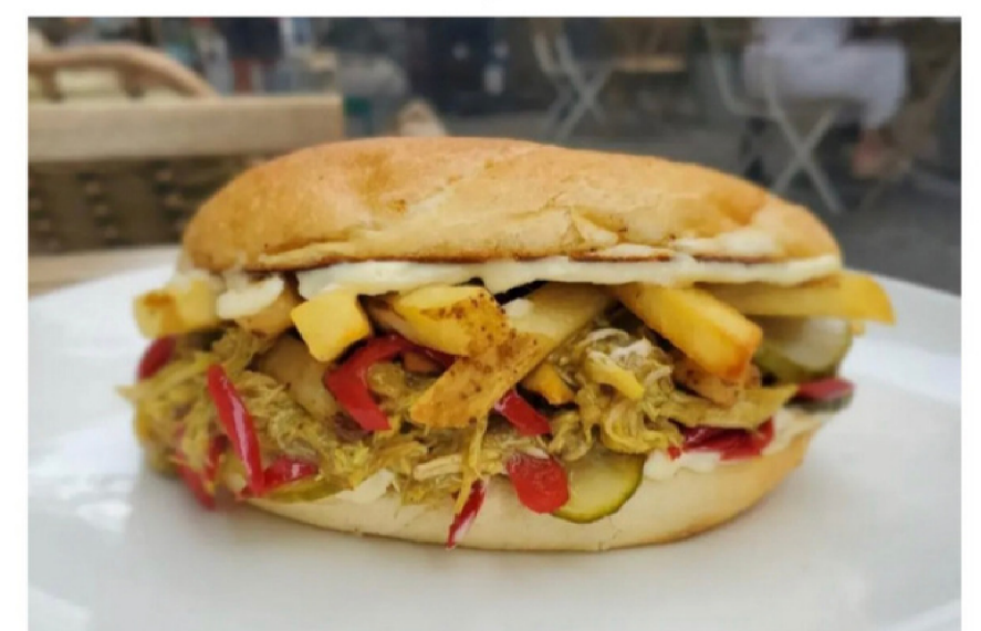
The Gatsby sandwich at Kaia Wine Bar, inspired by South African street food, features French fries, chicken spiced with garam masala and pickles.